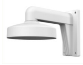
WML-S Wall Mount